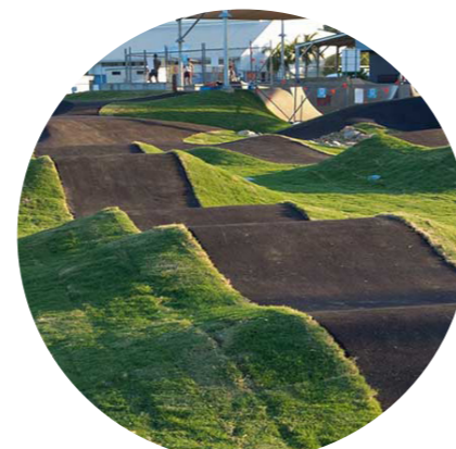
Mountain bike/pump track