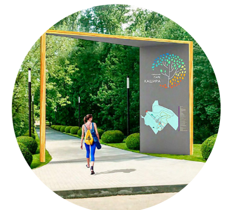
Integrated gateway and interpretive signage