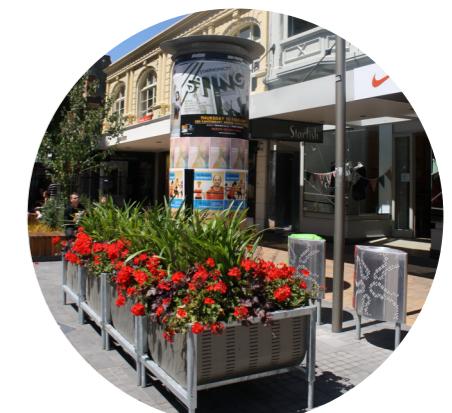
Urban community garden