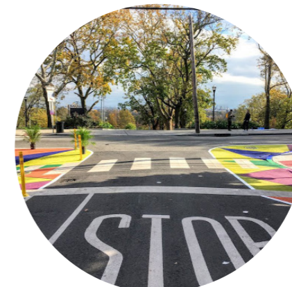
Tactical urbanism at crossings