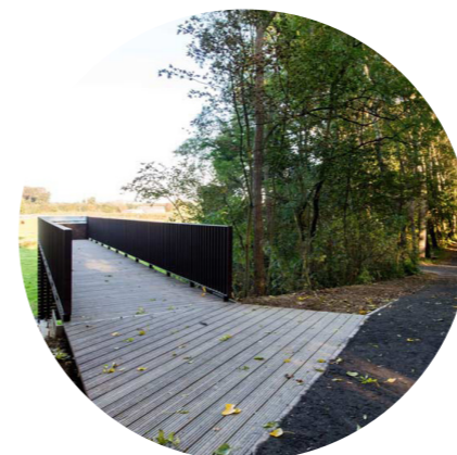
Viewing platform along river