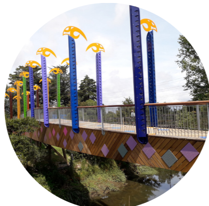
Active modes bridge