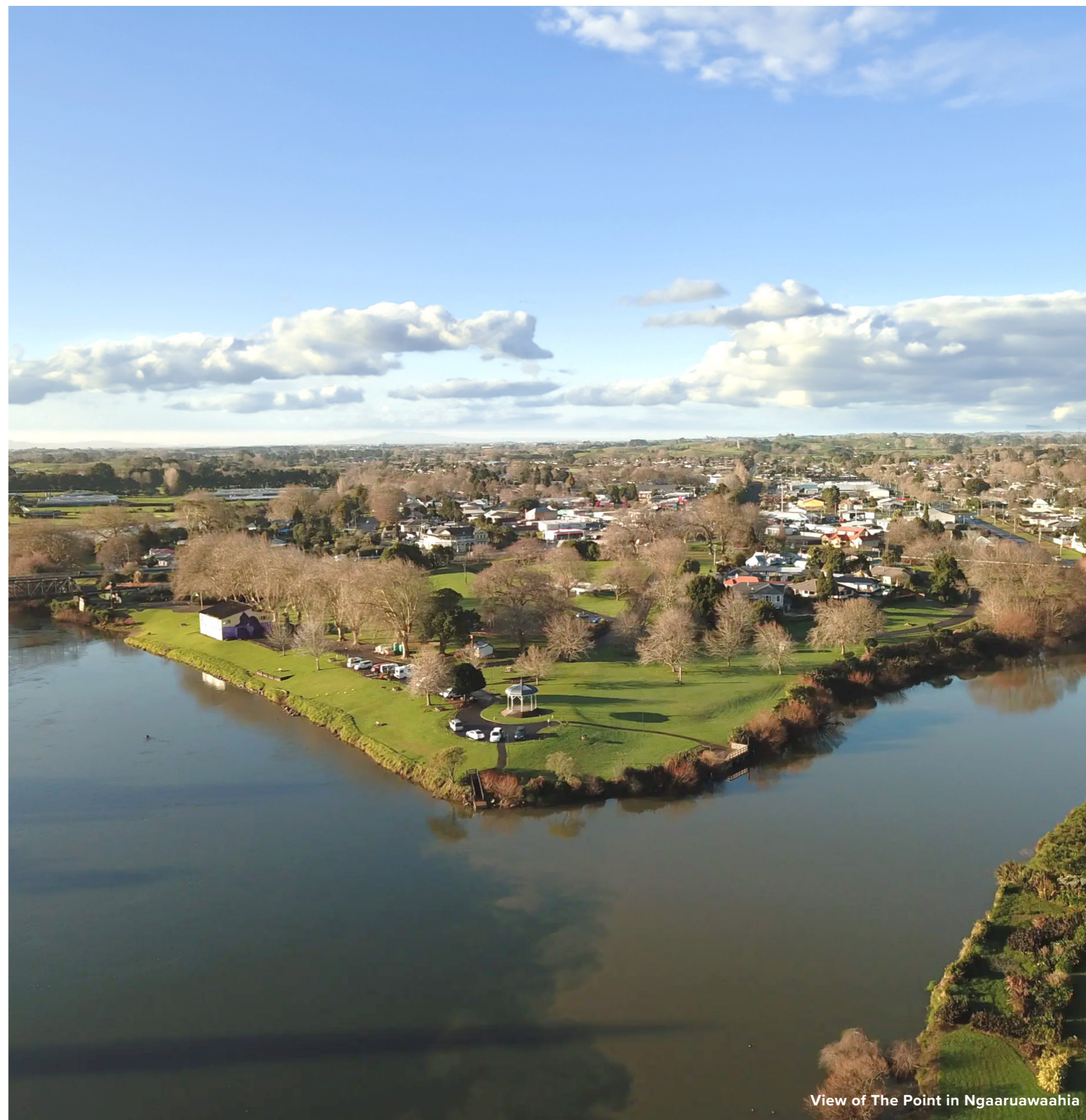
View of The Point in Ngaaruawaahia

Walking and cycling activities have been identified separately as inputs from the Transport Workstream.