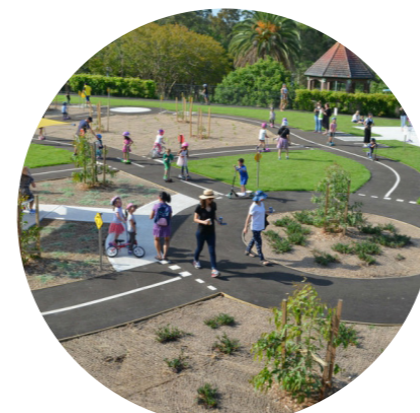
Kids bike park