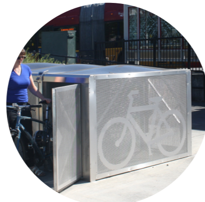
Sheltered and protected bike parking