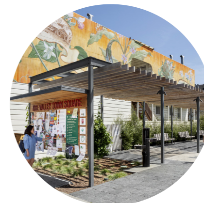
Village green/Town Square