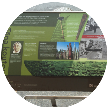
Cultural storytelling signage