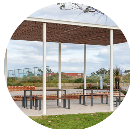
Shelter and shade at parks