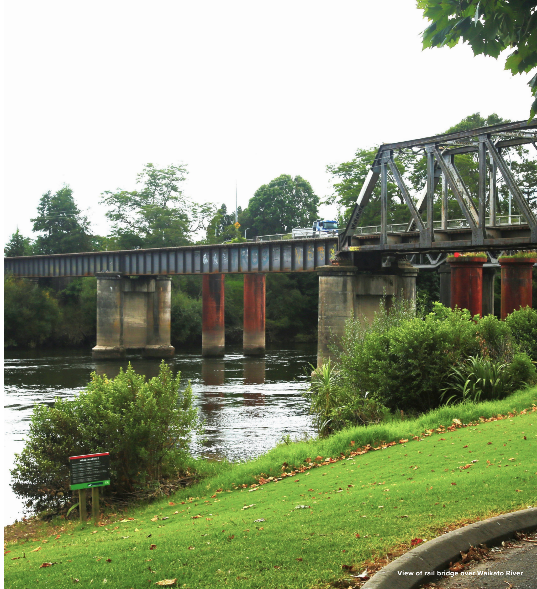
View of rail bridge over Waikato River

The following pages provide a summary of the opportunities identified through this process. Some of the opportunities sit outside of the remit of Waikato District Council, however were recorded to fully understand the issues and opportunities seen by the community. These opportunities have been assessed and considered by Council as part of this process and have informed the key moves and outcomes. Not all opportunities have been progressed.