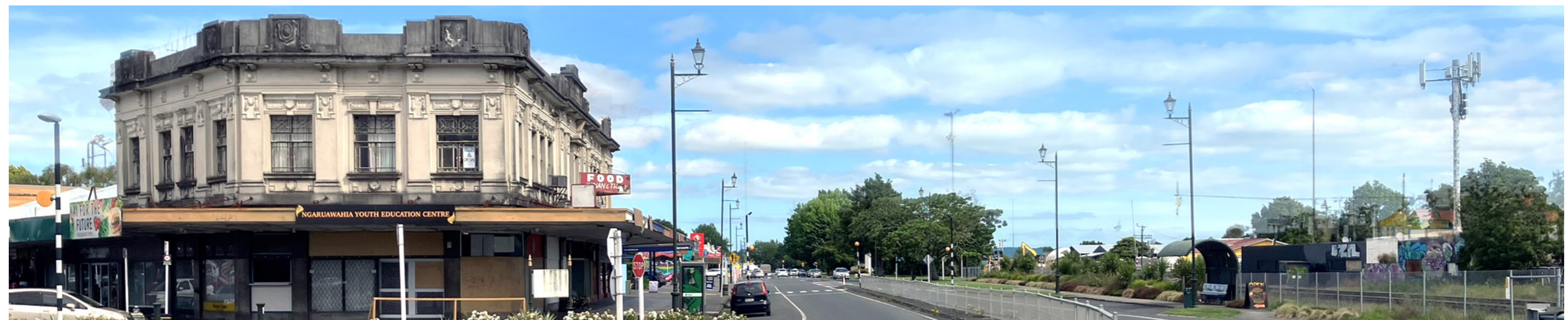
View of Great Street Road in Ngaaruawaahia