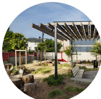
Urban play in Village Green