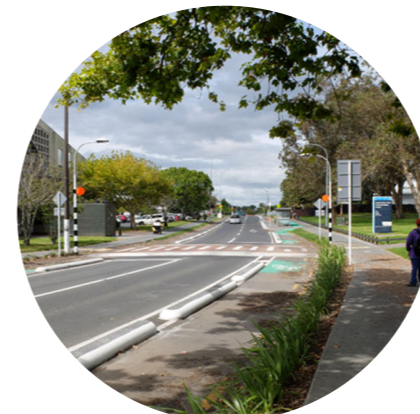
Separated active modes parking