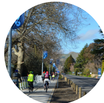
Protected cycleway on Great South Road