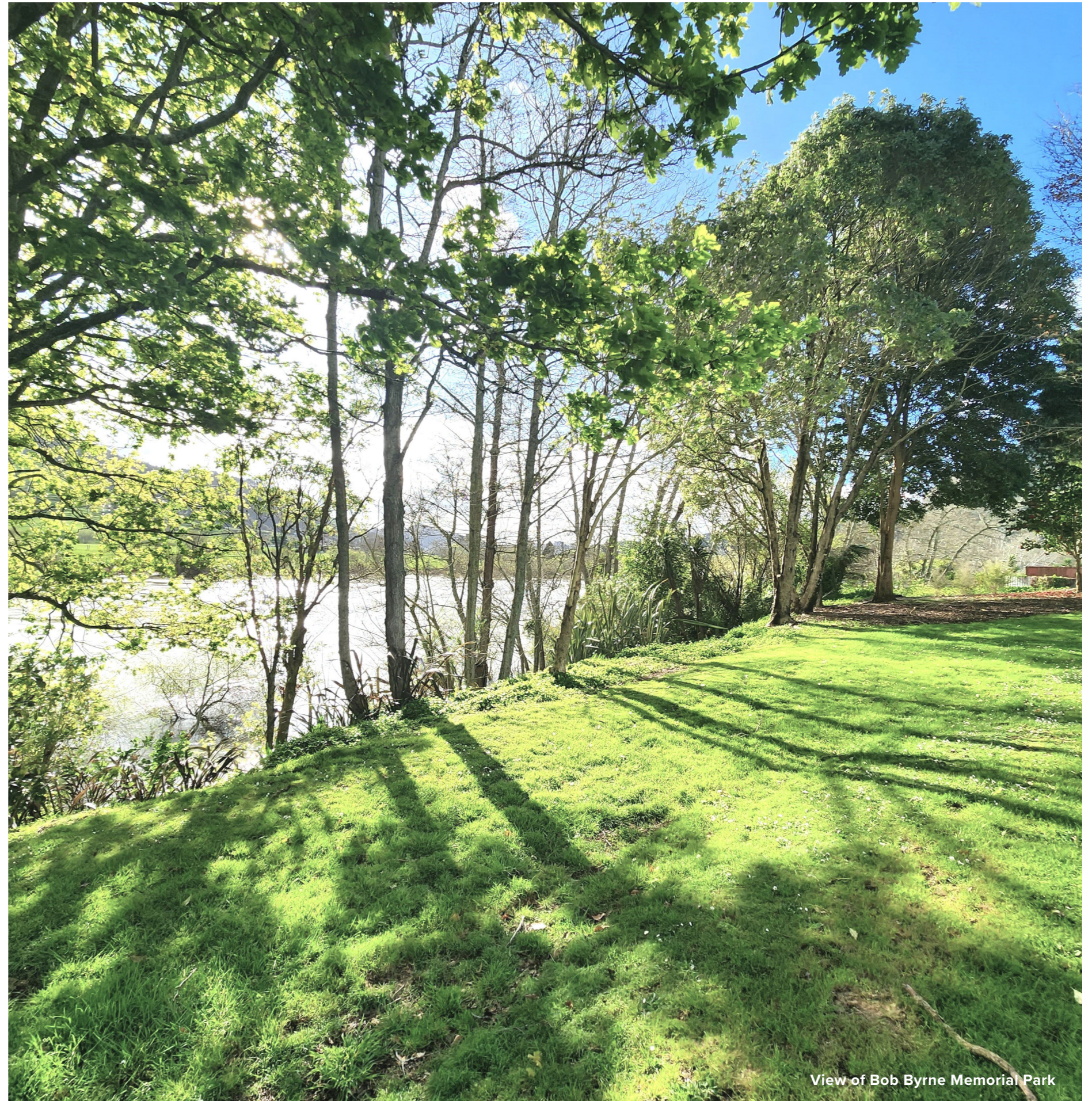
View of Bob Byrne Memorial Park

Walking and cycling activities have been identified separately as inputs from the Transport Workstream.