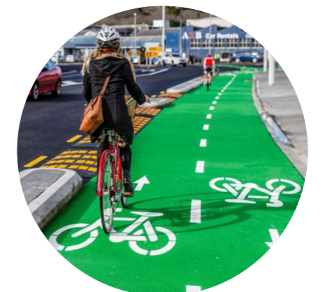
Separated cycleway on Great South Road