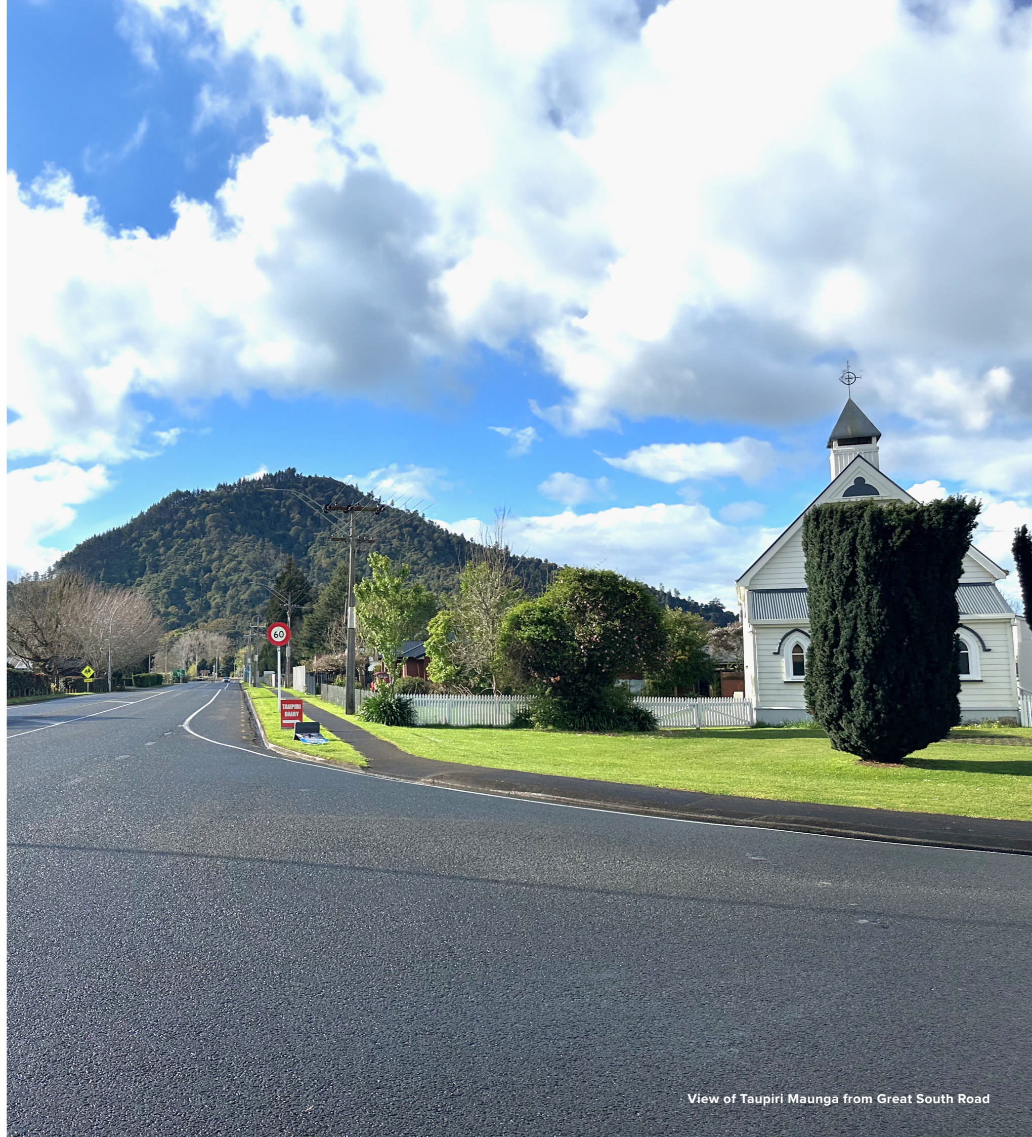
View of Taupiri Maunga from Great South Road

The following pages provide a summary of the opportunities identified through this process. Some of the opportunities sit outside of the remit of Waikato District Council, however were recorded to fully understand the issues and opportunities seen by the community. These opportunities have been assessed and considered by Council as part of this process and have informed the key moves and outcomes. Not all opportunities have been progressed.