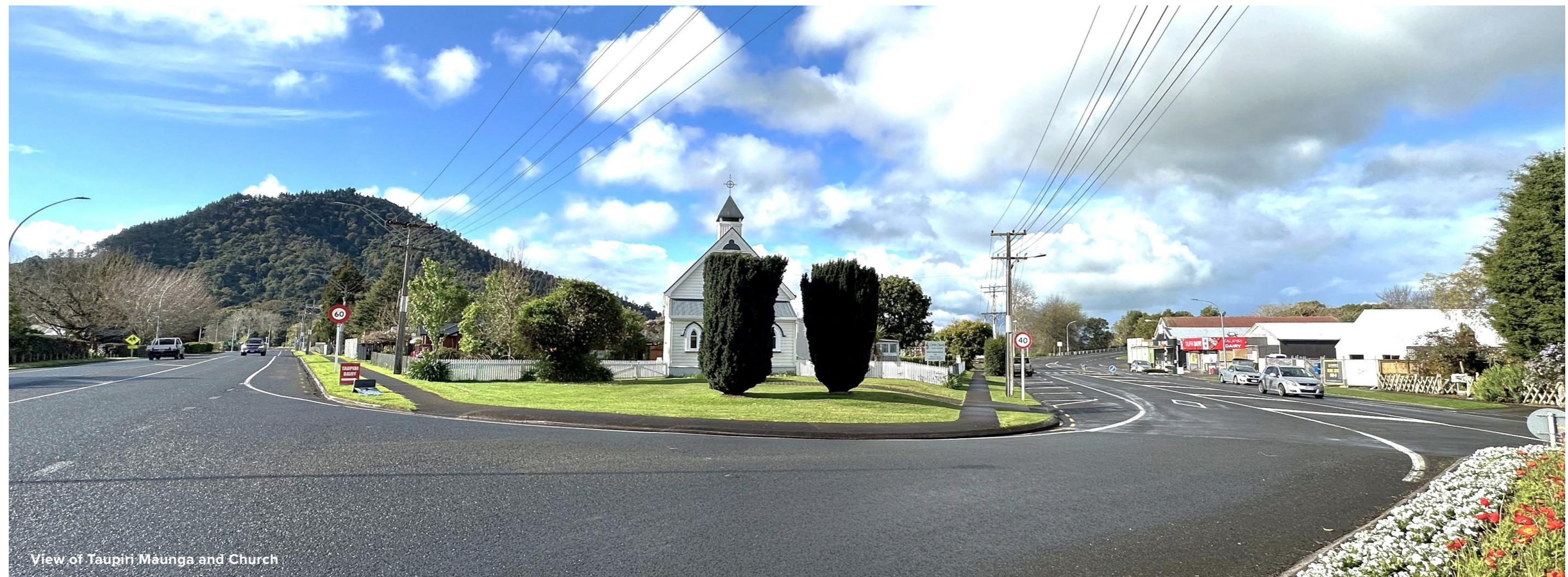
View of Taupiri Maunga and Church