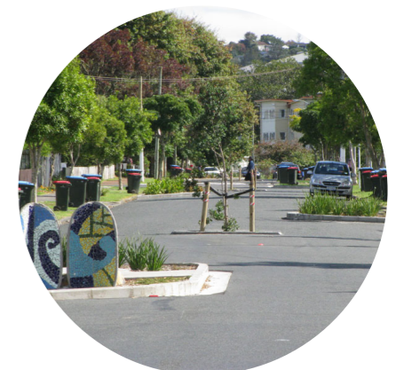
Traffic calming with planted buildouts