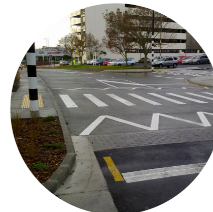
Raised pedestrian crossing