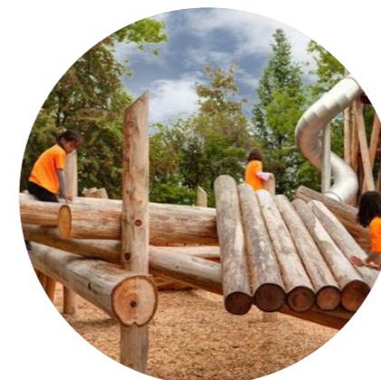
Nature play at Bob Byrne Memorial Park