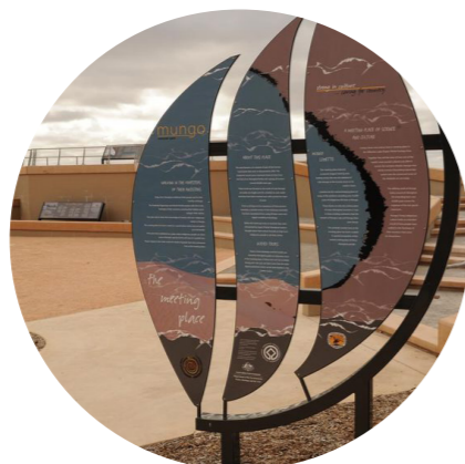
Storytelling and cultural narratives